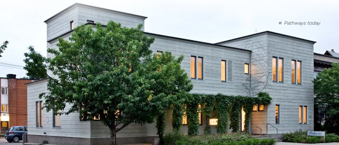
« Pathways today

Pathways' roots are strong because they were planted with love by our founders, and then nurtured and grown by the very community for whom it was created. From this foundational wisdom and compassion, Pathways continues to innovate and invite ever-expanding opportunities for each of us to care for one another while becoming active participants in our own healing.